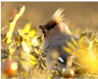
Waxwing at Halligarth