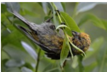
Above: Two-barred crossbill at Halligarth

Halligarth House was uninhabitable prior to being gifted to the Trust. It is currently the subject of a listing application with Historic Scotland. The garden is not promoted or managed as a visitor site, but is a major draw for wildlife and bird watchers. With limited resources to repair the property and bring it back into use as residential, and aware of very strong community interest in the property, the Trust is working with the local community and other stakeholders to identify the most viable use. The property has a rich social history, inexorably linked to ornithology