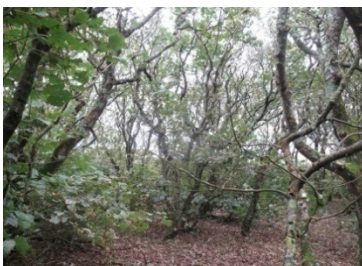
Above: The walled wood

While the gift includes a number of buildings and monuments (some in use, some uninhabitable) the most significant features of the land managed by the Trust on Unst are of natural heritage. Unst is a major European breeding ground for seabirds and moorland-nesting rarities such as Great Skuas, Arctic Skuas and Whimbrels. Three of the Trust sites are of national importance, being Sites of Special Scientific Interest (SSSI). These are important breeding areas for Red-throated Divers and Great Skuas in Unst and Yell. Also of note are Red-necked Phalarope sites. Halligarth includes the most northerly woodland in the UK, a walled, mature (mainly) sycamore wood of half an acre which attracts a diversity of wildlife and is particularly popular for bird watching.