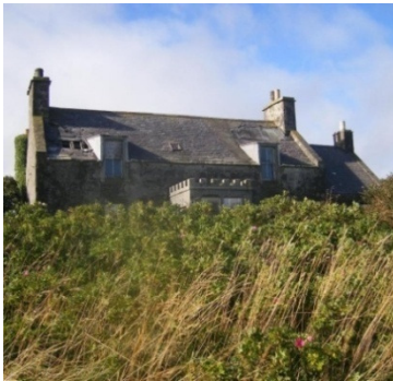
Above: Halligarth House 2012

Options currently under consideration for inclusion in the study include community management of the woodland to protect the bird habitat and promote access to this unique resource, accommodation and/or research facilities for bird watchers attracted to the woodland and nearby national nature reserves, and a centre to celebrate the natural heritage of the area and the legacy of the Edmondston and Saxby families to ornithology. In parallel with the study, the potential for two neighbouring vacant dwellings to aid the viability of a community led project at Halligarth will be explored.