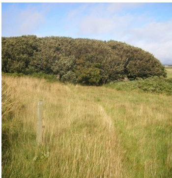
Above: The approach to the wood from the house

Options currently under consideration for inclusion in the study include community management of the woodland to protect the bird habitat and promote access to this unique resource, accommodation and/or research facilities for bird watchers attracted to the woodland and nearby national nature reserves, and a centre to celebrate the natural heritage of the area and the legacy of the Edmondston and Saxby families to ornithology. In parallel with the study, the potential for two neighbouring vacant dwellings to aid the viability of a community led project at Halligarth will be explored.