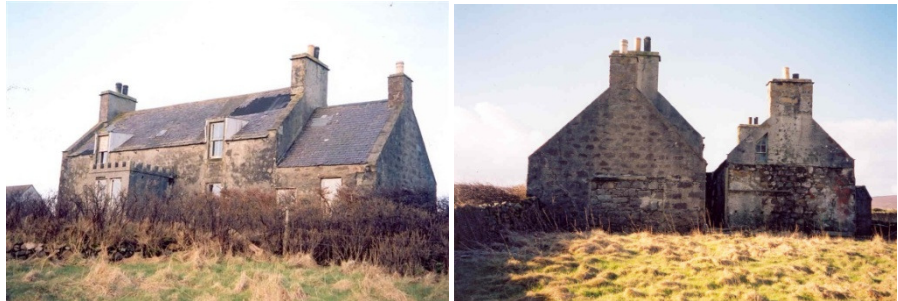
Right: Halligarth House from the east and (far right) from the north east

and nature conservation, alongside built and natural resources that could be utilised for community benefit. Halligarth has the potential to further encourage and promote the natural and social heritage of the island. The woodland is a rich natural resource, attracting wildlife and bird watchers to the area, but the whole site needs to be better understood, protected and utilised for community and educational benefit.