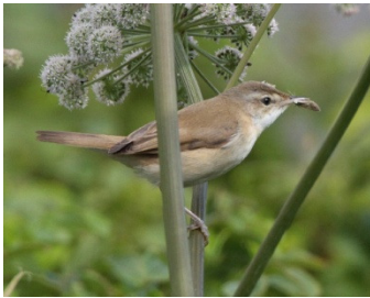
Paddyfield warbler, Halligarth