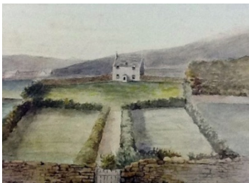
Above: Halligarth in the late 19C