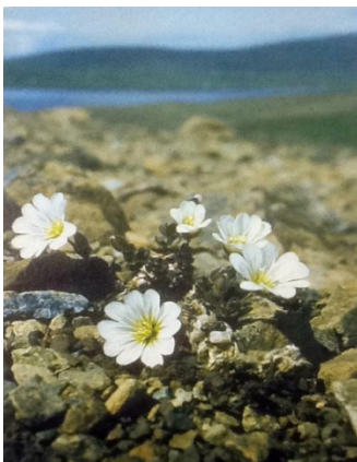
Above: Edmondston's Chickweed, Keen of Hamar