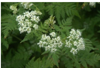
Sweet Cicely at Halligarth

As Shetland's oldest woodland, and the UK's most northerly, Halligarth is a site of immense ecology and nature conservation importance.