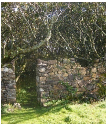
Above: Entrance to the walled wood

Partnering the Trust in the study is the Shetland Amenity Trust. Other local interest groups and stakeholder organisations, including the Unst Partnership, RSPB and SNH, will be invited to participate in the study.