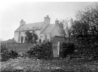
Above: Halligarth c1910