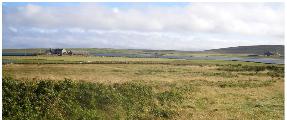
Above: View from Halligarth to the south, across Balta Sound